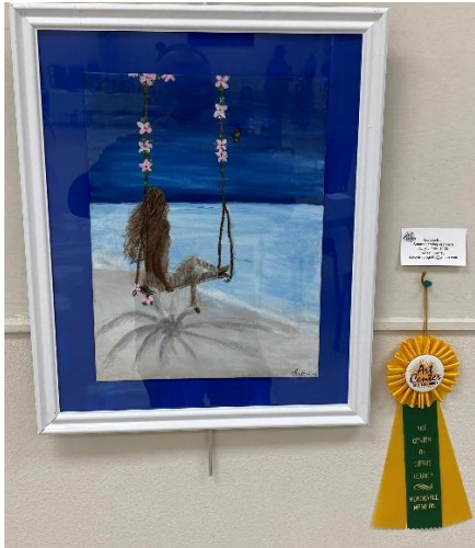
LORETTA BELL – HONORABLE MENTION “SUMMER SWING @ BEACH”