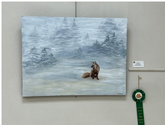
HONORABLE MENTION – PAT DOERR