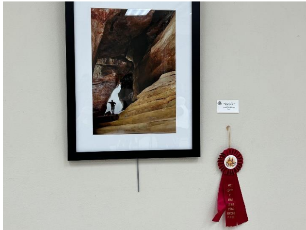
2 ND PLACE – DAVID REED