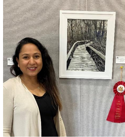
PREETI LEKHRA – 2 ND PL PHOTOGRAPHY “THE PATH IN WILDERNESS”